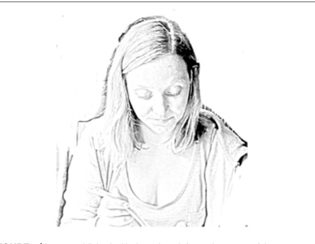
FIGURE 1 | Image published with the written informed consent of the depicted adult.

There might have been other lexical or non-lexical terms that parents could use at this moment. There are, for example, instances in the data corpus when an audible and extended inbreath (almost, but not quite, an "ooh") is used to announce a new food, but these typically occur when it is someone else who brings the food. As such, we might speculate that such audible inbreaths enact surprise rather than enjoyment per se . By contrast, the prosodic formation of the gustatory mmm signals the arrival of the food as being a specific type of object (one that anticipates