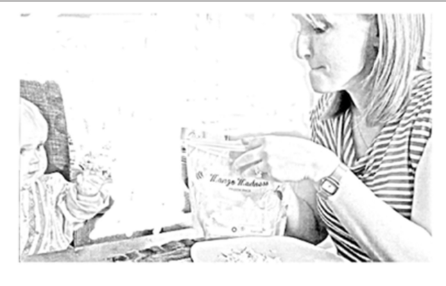
FIGURE 2 | Image published with the written informed consent of the depicted adult and of the parents of the depicted child.

enjoyment) or of the preparation of the meal as a preface to the enjoyable event.