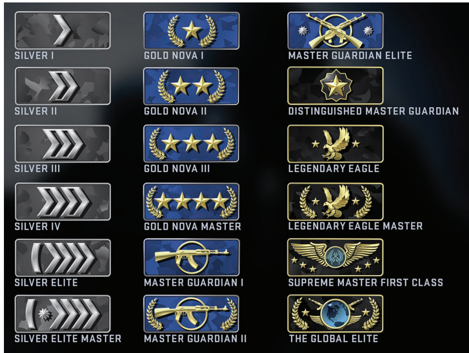
FIGURE 2 | The 18 current competitive skill rankings for first-person shooter esports game, Counter-Strike:Global Offensive (CS:GO).