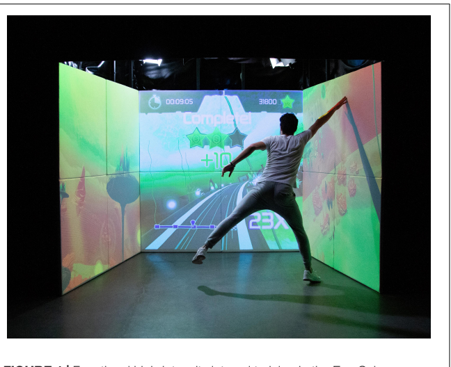
FIGURE 1 | Functional high-intensity interval training in the ExerCube.

The ExerCube (Figure 1; Martin-Niedecken and Mekler, 2018; Martin-Niedecken et al., 2019a,b) is an immersive mixedreality fitness game for single or multiple players. The player is surrounded by three walls that serve as projection screens and haptic interfaces for energetic bodily interactions. A customized motion-tracking system tracks players' movements via HTC Vive trackers (attached to their wrists and ankles). In the functional fitness game scenario Sphery Racer, which is projected onto the walls of the ExerCube, the player races along a fast-paced sci-fi underwater race track via an avatar on a hoverboard. The motiontracking system transfers the executed movements (based on a functional workout) onto the avatar and thus onto the virtual racing track. Along the race, players are challenged by functional whole body exercises (e.g., squats, lunges, and burpees) and