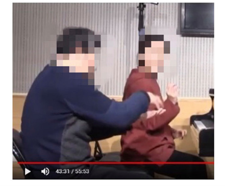
FIGURE 1 | Non-verbal behaviors in the observation study related to metaphorical timbre, ideal timbre, and illustrating sound-producing gestures.

an explicit explanation of what is referred to as "more," but she clarified her meaning by pushing the student from the back, which also changed the performance