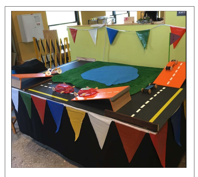
FIGURE 3 | Programming space during the third cycle of the Make it Roll program.

The interactions during tinkering were scored directly from the video records. Children's post-tinkering reflections were coded from verbatim transcripts. The procedures for establishing interrater reliability were the same for all coding systems. Specifically, two researchers independently coded 20% of the records and