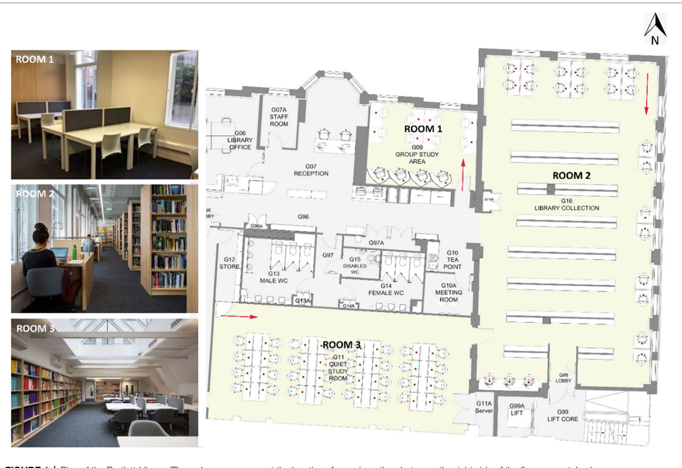
FIGURE 1 | Plan of the Bartlett Library (The red arrows represent the locations from where the photos on the right side of the figure were taken).

influencing their emotions and learning abilities. Many disciplines have extensively discussed the influential factors on seat preference in a learning environment. It has been shown that the affecting factors arising from the physical environment that govern the decision of seat selection are daylight (Othman and Mazli, 2012; Keskin et al., 2017), ambient temperature, type of furniture, proximity to other occupants (Dubois et al., 2009), quietness, outdoor view, privacy, social interactions such as close to friends, entrance or circulation (Gou et al., 2018), students' degree of territoriality and seat arrangements (Kaya and Burgess, 2007).