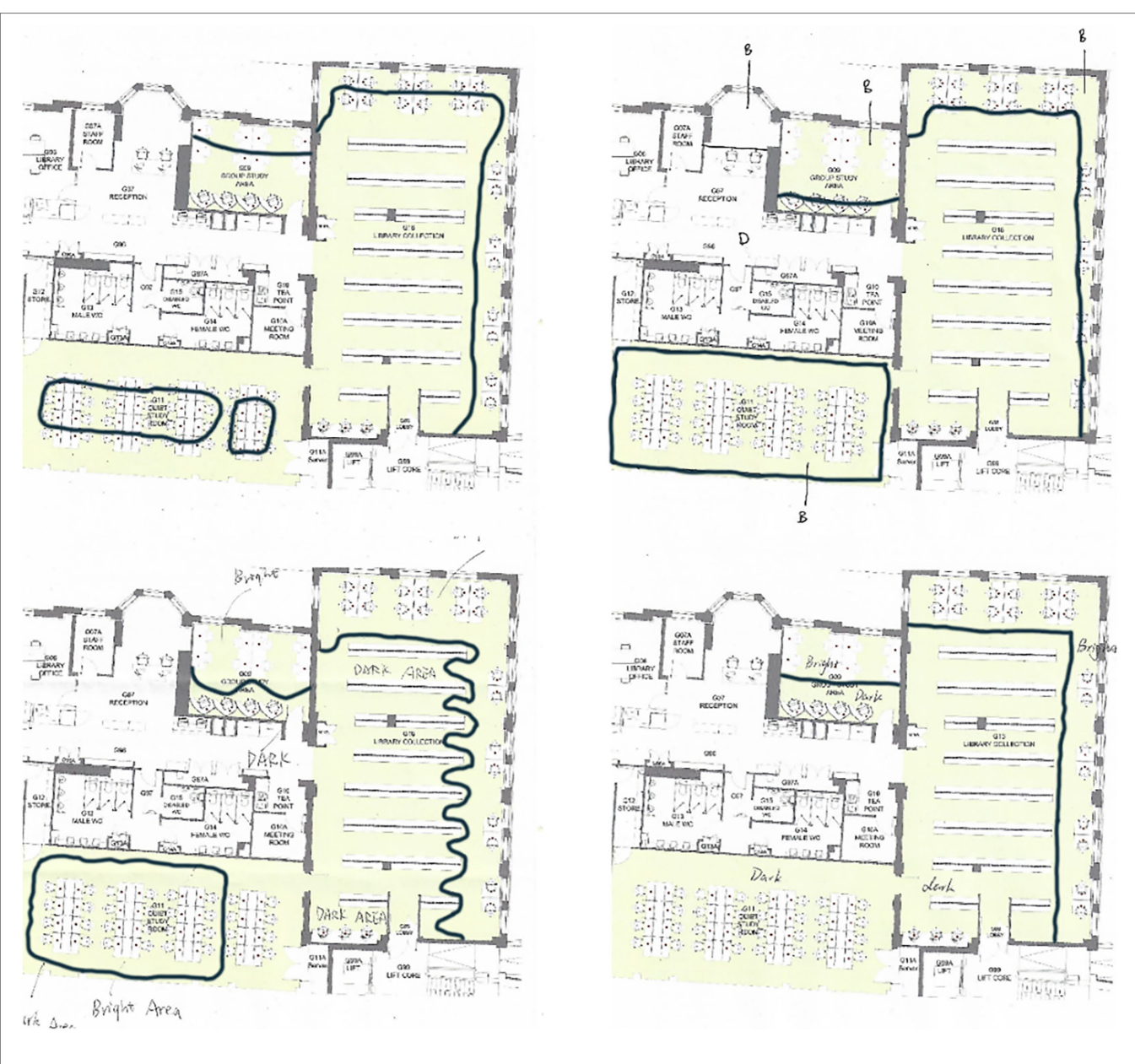
FIGURE 3 | A few examples of participants' drawings in response to the question asking them to draw a boundary line between daylit and non-daylit spaces.

Although, in general, participants seem to agree on the reasons given when selecting the best and worst seats, there were a few cases where a particular desk was selected as the worst and the best by participants. Although seat preference varied from person to person depending on individual needs and expectancies, the majority of the participants considered it important to have a satisfactory daylighting level, face the least people, and have an outdoor view of greenery.