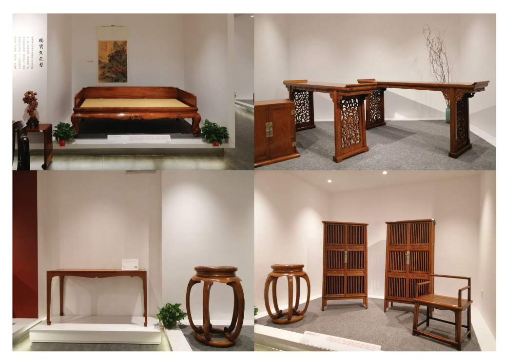
FIGURE 2 Classical furniture brand of Tanjuyuan.