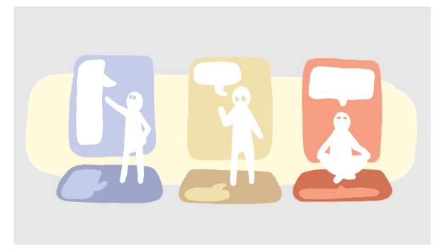
Assumption 1: Designed Liminal experiences are narrative in nature