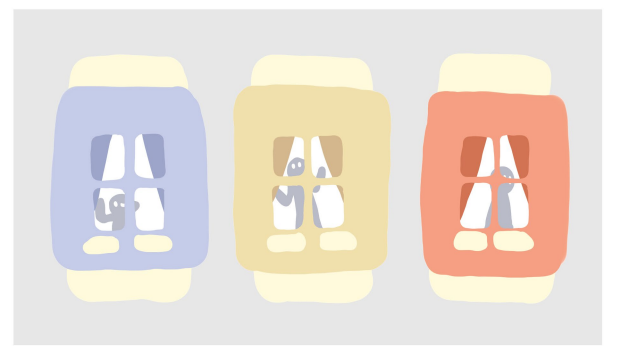
Assumption 4: Liminal spaces are sui generis – in a class in and by itself

However, both awe and liminality can involve a sense of being confronted with something that is beyond one's usual frame of reference or understanding. In both cases, the individual may feel a sense of wonder or amazement, and may be motivated to explore and learn more about the experience in order to make sense of it.