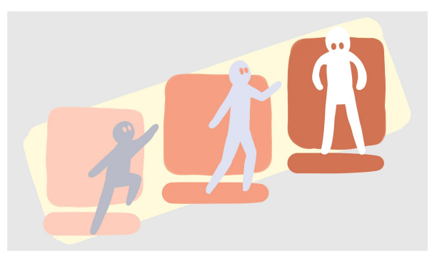
Assumption 3: Liminal spaces are conducive to personal transformation