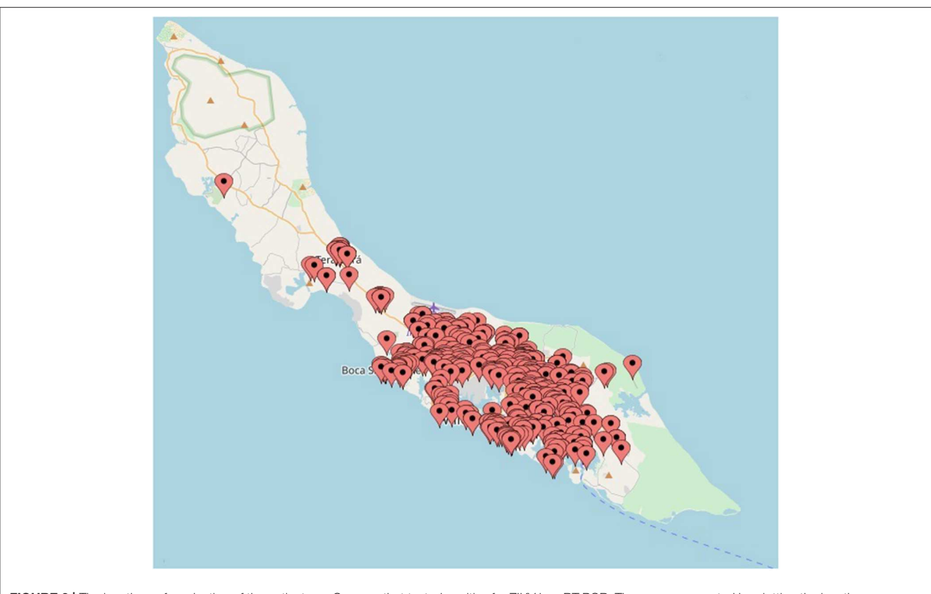
FIGURE 3 | The locations of a selection of the patients on Curaçao that tested positive for ZIKV by qRT-PCR. The map was created by plotting the locations on www. mapcustomizer.com.

introduction of the virus to be earlier, either between August 2013 and July 2014 (38) or between May and December 2013 (39). On Curaçao, according to our analyses, the first cases of ZIKV were diagnosed in December 2015, a month before the first notification to the WHO on 28 January 2016 (24), which indicates that the virus, most likely introduced by travelers, emerged earlier than officially reported. Given the rapid spread of the virus throughout the Americas after its emergence in Brazil, Curaçao, and Bonaire were not prepared for an outbreak of ZIKV, and diagnostic assays had therefore not yet been implemented and validated at MLS. This problem was circumvented by shipping patient samples to the diagnostic laboratory of the EMC in the Netherlands, a WHO Collaborating Centre for arboviruses. Starting from October 2016, MLS Curaçao had implemented the necessary commercial diagnostic qRT-PCR assay and ELISAs in order to continue the diagnosis of ZIKV-suspected patients on Curaçao and start with the diagnostics for Bonaire. Of note, this study was not designed prospectively but performed in reaction to a dynamic outbreak situation.