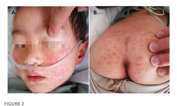
Pleomorphic rash of face (A) and trunk (B).

Patient's chest CT showed a few inflammatory lesions in the right upper lobe (A), the middle lobe, and the lower lobe of both lungs and the lower lobe of both lungs (B) on the first day of admission.