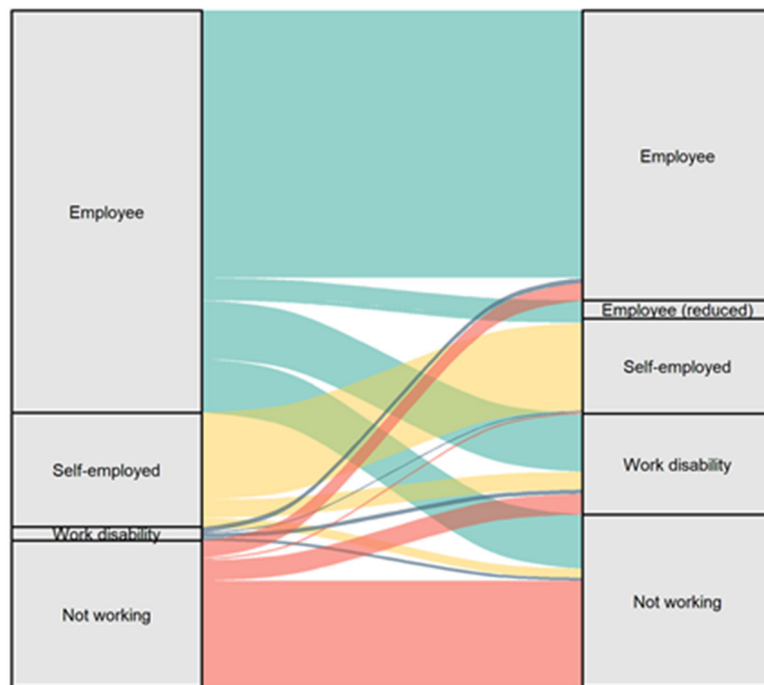
FIGURE 2 Alluvial plot displaying employment status pre-TBI and 1-year post-TBI.