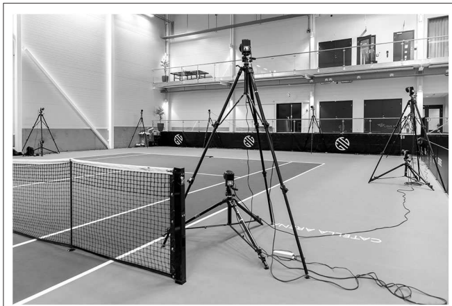
FIGURE 1 | Picture of the calibrated measuring volume with the majority of the motion capture cameras visible.