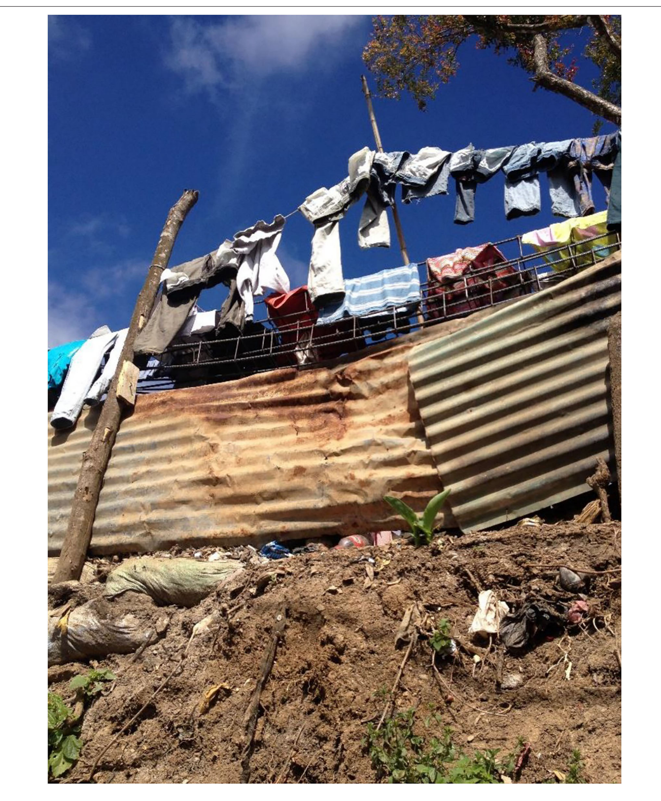
FIGURE 1 | Household living conditions.

asked participants whether they had recently disposed of one or more of these items and then asked exactly how they had disposed of them. If the participants had disposed of