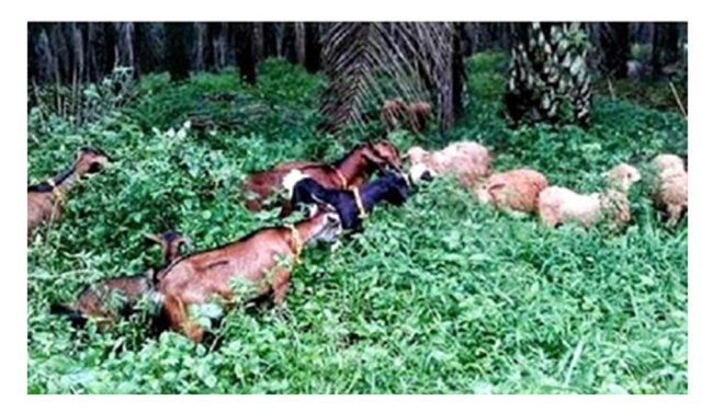
FIGURE 1 | Conventional oil palm plantation and oil palm-livestock integrated plantation. To improve the environmental sustainability of oil palm industry, commercial growers can switch from spraying chemical herbicides (top left) to targeted livestock grazing (top right). Mixed species grazing which combines two or more ruminant species with different foraging strategies (grazer or browser) can be integrated into weed management in industrial oil palm plantations. For example, goats and sheep are browsing and grazing ruminant, respectively (bottom).

primarily implemented to provide additional income to oil palm growers via production of animal-based proteins (Devendra, 2009, 2011; Ismail et al., 2014; Zamri-Saad and Azhar, 2015). Generally, the integration can optimize the use of agricultural land area. Instead of producing solely palm oil, the same agricultural land space can also be used to produce beef for domestic markets.