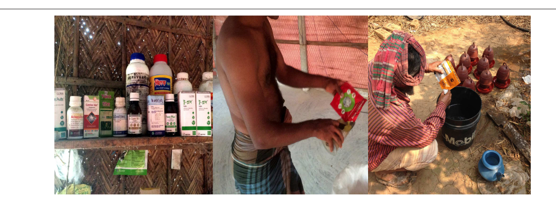
FIGURE 1 | Application of antibiotics in poultry feed and drinking water.