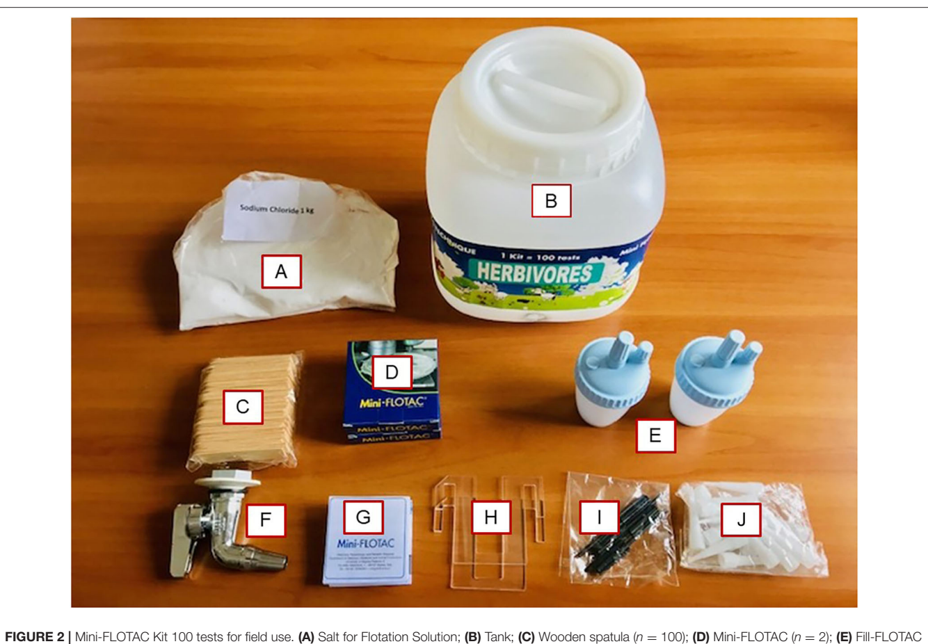
FIGURE 2 | Mini-FLOTAC Kit 100 tests for field use. (A) Salt for Flotation Solution; (B) Tank; (C) Wooden spatula (n = 100); (D) Mini-FLOTAC (n = 2); (E) Fill-FLOTAC (n = 2); (F) Tap; (G) Instructions; (H) Microscope adaptor (n = 2); (I) Devices to disassembly Fill-FLOTAC; (J) Tips for Fill-FLOTAC.

to float. Therefore, the Mini-FLOTAC, as other flotationbased techniques, is affected by these factors (8, 28–30). For these reasons, Standard Operating Procedures recommend standardized preservation protocols: for livestock, feces freshly collected can be preserved up to 3 days, or as yet mentioned, under vacuum up to 21 days, at +4^{\circ} C. However, fixatives used for preserving human stool samples usually contain formalin which is toxic, therefore special precautions have to be used for personnel's safety (e.g., use of cabinet or masks) and for discarding the analyzed fecal samples (e.g., containers for special hazardous waste).